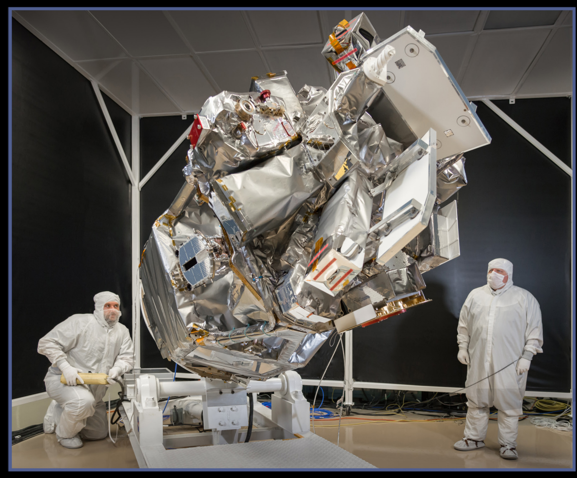
Orbital ATK engineers inspect the completed ICON observatory. www.nasa.gov

Exploring Where Earth's Weather Meets Space Weather